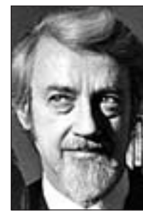
Lister Sinclair hosted the CBC radio program Ideas for 16 years. The broadcaster and playwright died Monday at age 85.

Sinclair also spent time as host of CBC-TV's The Nature of Things and appeared on numerous shows including Front Page Challenge , Telescope ,