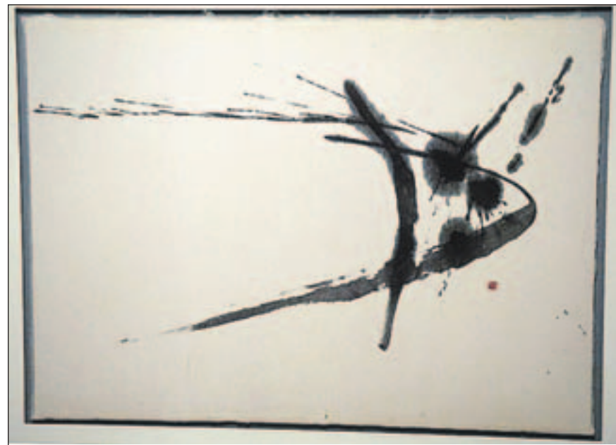
Ink-wash painting by Noriko Maeda, titled Blue Moon.