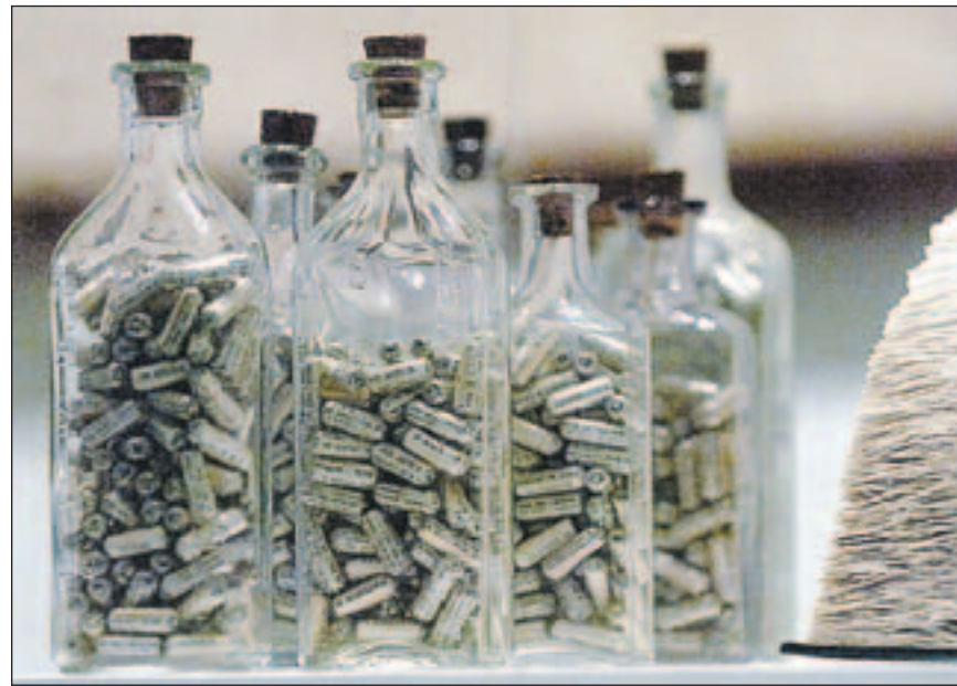
Installation by Paul Roorda, titled Once Daily, uses altered Bible and bottles.